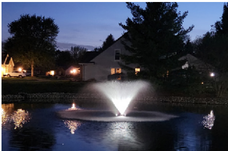
Charleston Crossing detention aeration

Homeowner's Associations and Neighborhood Groups within Fishers City Limits