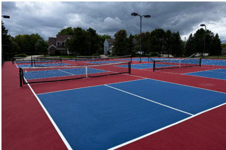
Gray Eagle court improvements