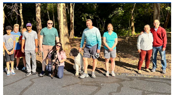
Sand Creek Wood Volunteers

Department of Planning & Zoning Fishers Municipal Complex