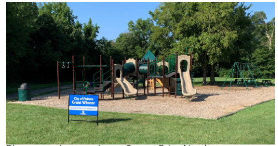
Playground upgrades at Sweet Briar North