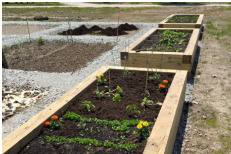
Community Garden Beds