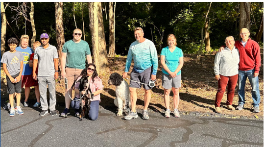
Sand Creek Wood Volunteers