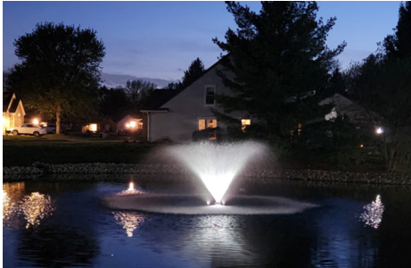
Charleston Crossing dention aeration