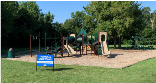
Playground upgrades at Sweet Briar North