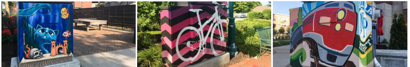
2016 Nickel Plate District art installation.

In 2016, the City of Fishers coordinated with Fishers Arts Council to have eight signal boxes painted within the Nickel Plate District, a state-recognized Cultural District. These art pieces add art and color along E. 116th Street, Commercial Drive, and Municipal Drive.